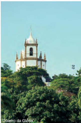
Oura da Glória

For more information about Rio de Janeiro city, please visit: http://www.rioguiaoficial.com.br/